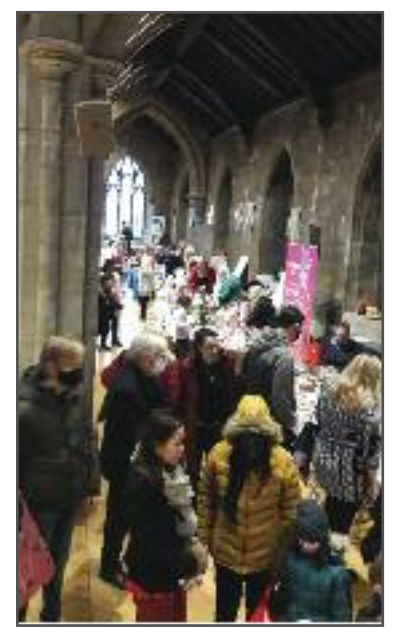
Shoppers at the Charity Market